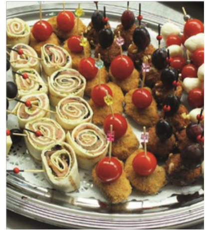
Piece 3,20 €